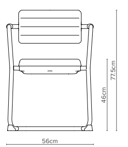
— 02/2 Depth 57cm Weight 9.2kg Stacks up to 5 high Cantilever