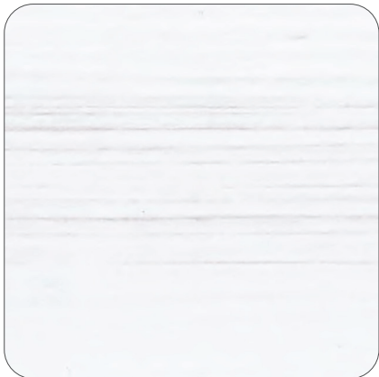
Anderson Pine White R55011 RU