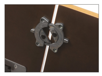
Rotary table connector