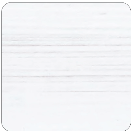
Anderson Pine White R55011 RU