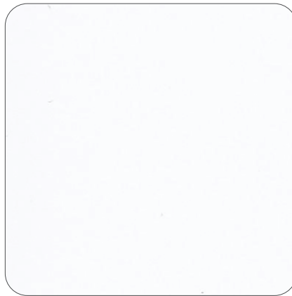
Royal White U11209 VV