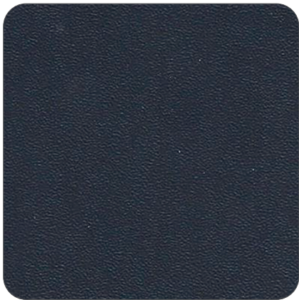
Graphite Black U12007 MP