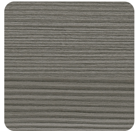
Bodega Grey R55032 RU