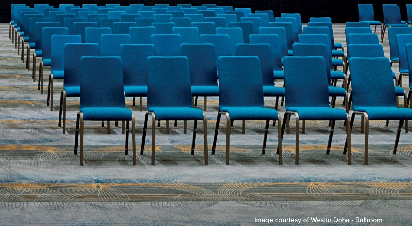
Ballroom