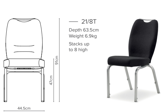
— 21/8T Depth 63.5cm Weight 6.9kg Stacks up to 8 high