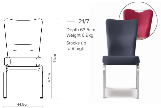
— 21/7 Depth 63.5cm Weight 6.9kg Stacks up to 8 high