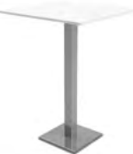
Base Size: 40cm (Sq)