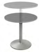
Base Size: 55cm (Dia)