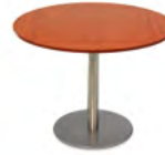
Base Size: 55cm (Dia)