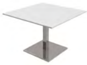
Base Size: 60cm (Sq)