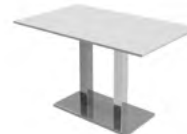
Base Size: 75cm x 40cm