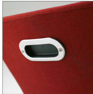
Optional recessed handle