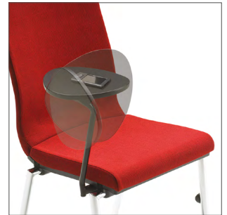
Optional detachable tablet