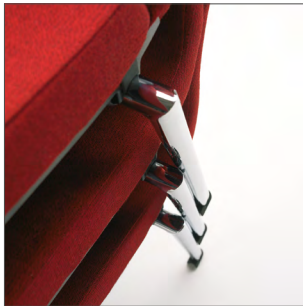
Increased stacking stability