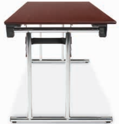
Leg configuration on 75cm wide table