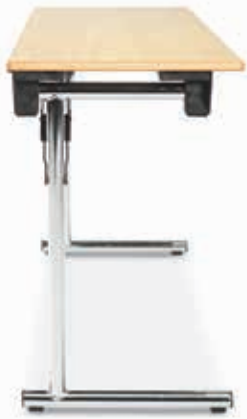
Leg configuration on 45cm wide table

A selection of table top finishes are available and the frames can be finished in a choice of chrome plated mild steel, or a wide selection of epoxy powder coated colours.