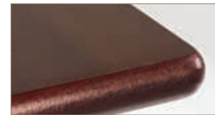
High pressure laminate with bull-nose hardwood lip