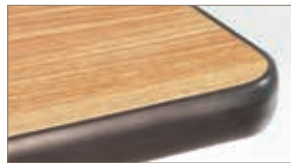
High pressure laminate with black vinyl T-Barb edge