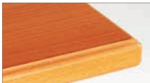
Wood laminate with hardwood leading edge