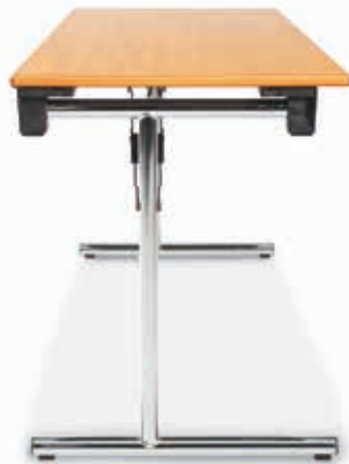
Leg configuration on 60cm wide table