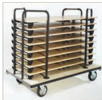
Table Trucks - TTF.C

Detachable modesty panels can be fitted as required